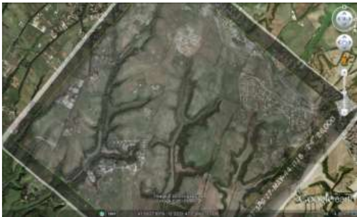
RAF photo in KMZ digital format, on Google Earth platform