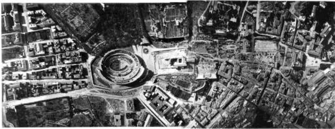
G.M., Rome, Coliseum and Forums, 1908