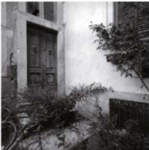
CONTROSPAZIO LA TERRA NEGATA ALL'IDENTITÀ