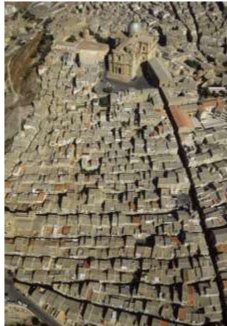
Piazza Armerina, 2003