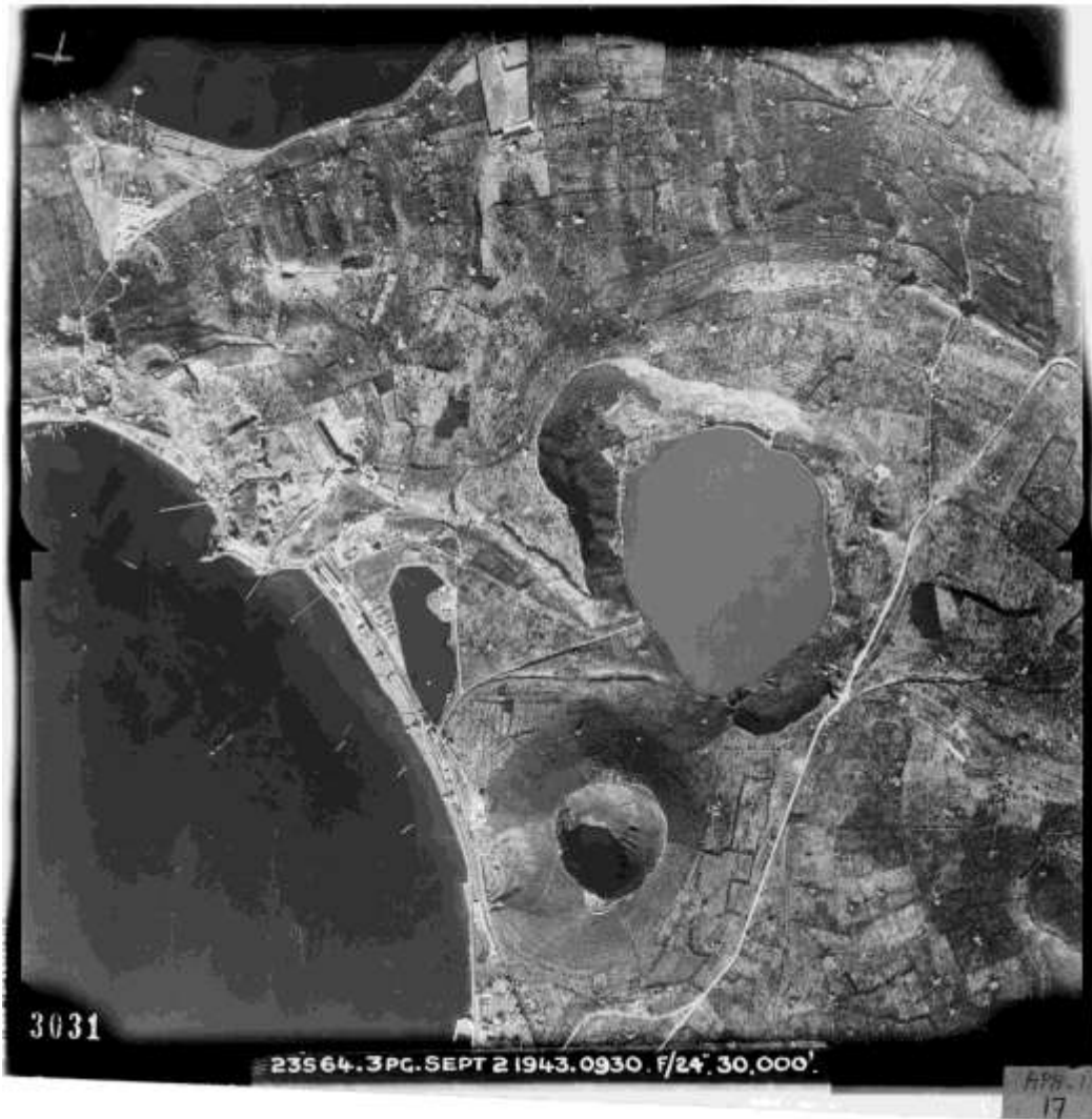
RAF, Phlegrean Fields, near Naples, 1943