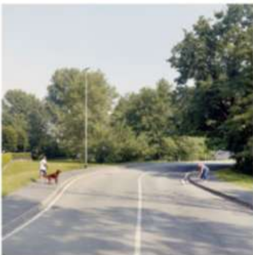
CORPI DI REATO UN'ARCHEOLOGIA VISIVA DEI FENOMENI MAFIOSI NELL'ITALIA CONTEMPORANEA